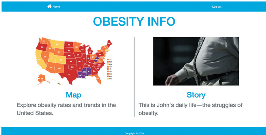
Figure 1. (a) The homepage of the stimulus website, (b) Screenshots of the interactive storytelling condition, and (c) A screenshot of the control condition. Note: Participants were provided with a piece of the story plot along with a few options to choose (upper image). After they click an option, the relevant story was presented (bottom image). They could then click the “next” button to proceed and continue to read the story, where they would be offered a few buttons to click on and interact with the narrative content again. Note: All the story content and corresponding outcomes of each possible story plot are presented on the same page. Participants would simply scroll down the entire page.

The full story included five sections: John starting his day, meeting his clients at a restaurant, experiencing a heart attack, speaking with his doctor, and trying to tackle obesity issues. In each section, a prompt was included to encourage users to think “what will John do next.” By clicking on different options in each section, participants could read what John would experience in terms of potential consequences. To move forward, participants would click on a “Next” button at the bottom of each page to read the next paragraph (Figure 1(b)). The control condition contained all branches of the information that were possible in the interactive narrative on a single page, without any user action, except for a scroll bar. All options and their story elements were listed in a linear fashion on one page (Figure 1(c)). The story in both conditions had 1,027 words to read.